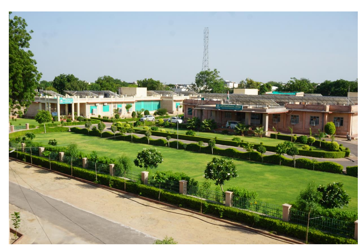
Agriculture University Jodhpur